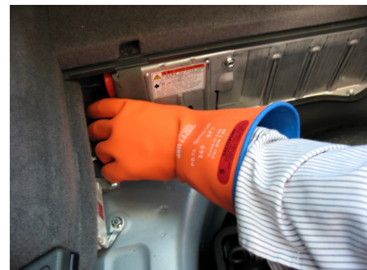
After putting on insulating gloves, the technician disconnects and removes the battery service plug. 2007 Toyota Prius hybrid shown.

Assuming that the vehicle's high-voltage system has been properly shut down, and you are wearing your insulating gloves, the voltage reading can be taken. Before doing so, turn on the meter, select "volts dc", and verify that the meter is working by measuring a known low-voltage current source such as the vehicle's 12 V battery. Faulty meters or leads can produce a false "zero voltage" reading!