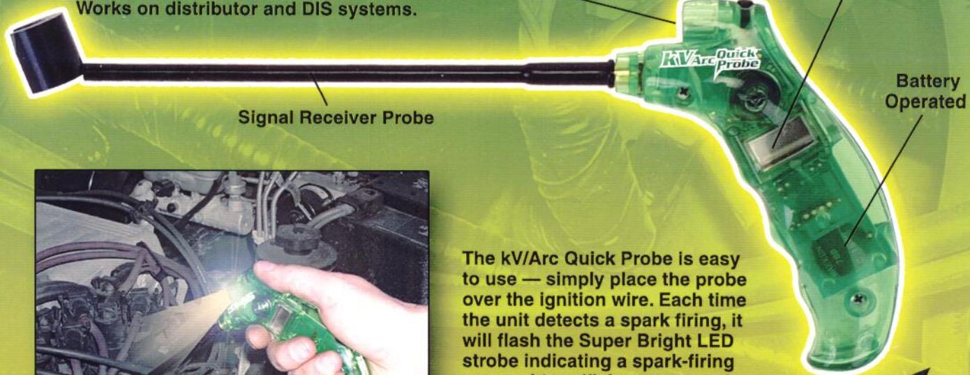
Signal Receiver Probe

Measures and displays peak spark voltage (kV).